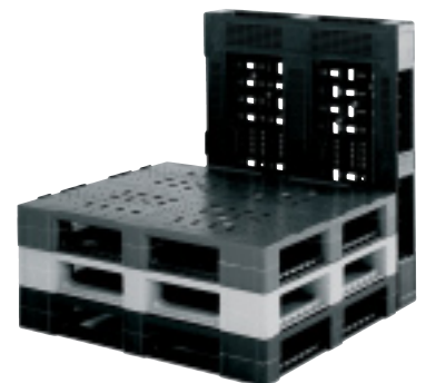
1200x1000mm Plastic Pool Pallet

Our range of ESD & conductive, as well as flame retardant products, are just examples of Arcawa's commitment to continuously innovate products that consistently meet or exceed customer expectations.