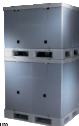
1200x800mm 1200x1000mm Hybox