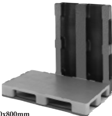
1200x800mm Hygienic Plastic Pallet version 2