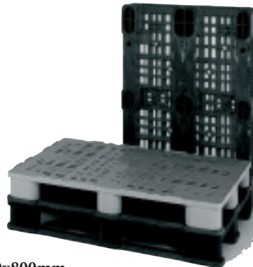
1200x800mm Plastic Pool Pallet