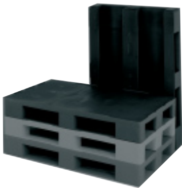
1200x800mm Hygienic Plastic Pallet version 1

at all levels of production. The further development in miniaturization and complexity of electronic circuitry are setting the trend towards packaging of approved conductive material. The Arcawa ESD- pallets and ESD-Hybox provide effective protection for handling electronic components in assembly, storage and processing areas.